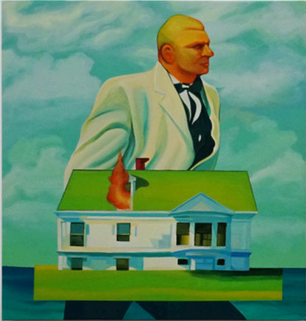
"Les vestiges du jour" Acrylic on canvas 57x54cm