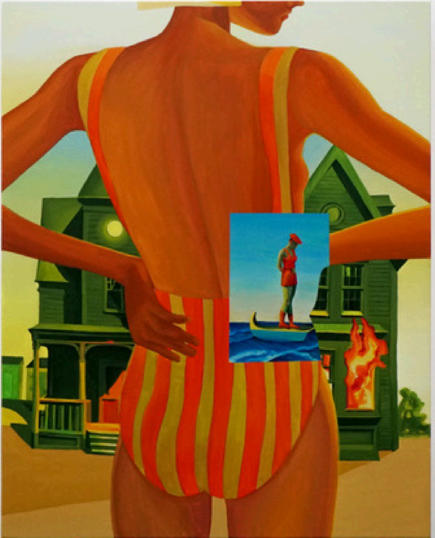
"Mis vacaciones de consumo" 97x67cm acrylic on canvas