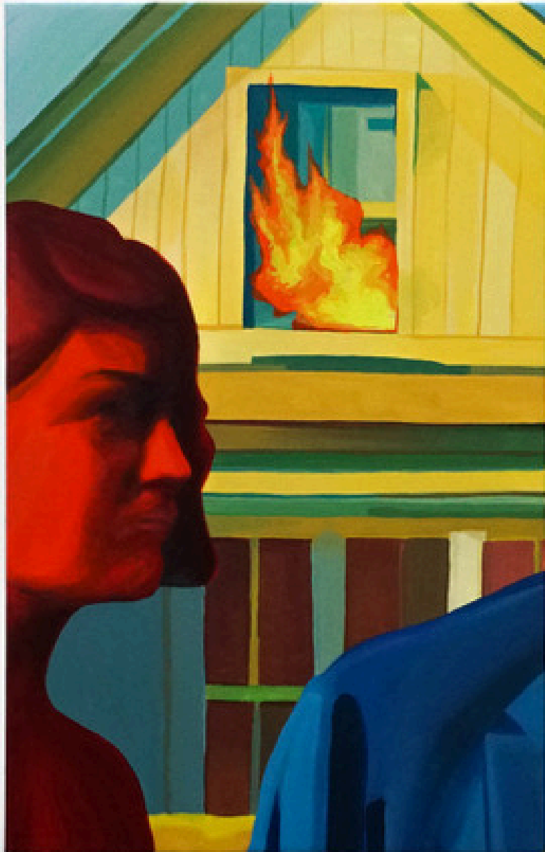
"Turn around" acrylic on canvas 37x58cm